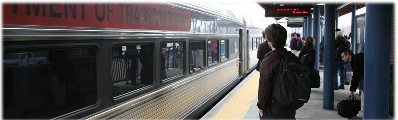
Metro North passenger train.

3.8 Locate government facilities that are likely to be visited by the public in areas served by multiple modes of transportation.