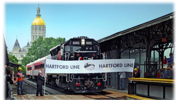
Union Station, Hartford.

6.7 Encourage COGs and economic development districts (EDDs) to develop coordinated and effective regional plans and strategies for implementing projects that address the priorities of each region.