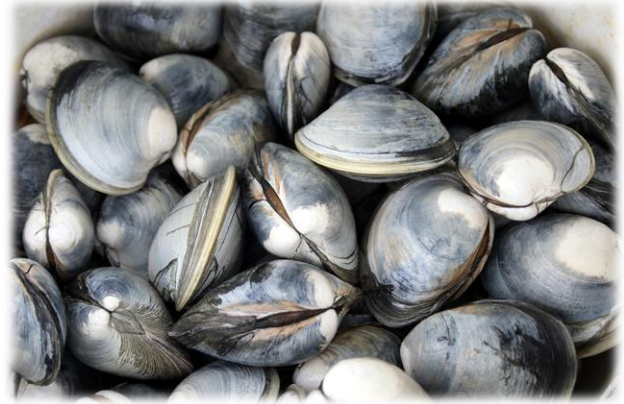
Clams harvested from Long Island Sound.

potential increased frequency and/or severity of flooding and drought conditions, including impacts to public water supplies, air quality, and agriculture/aquaculture production.