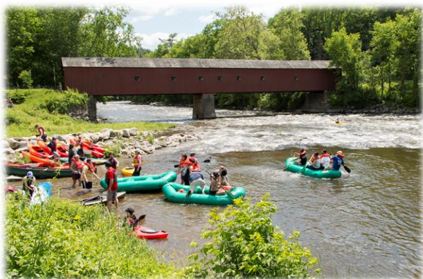
Salmon River State Forest.

4.8 Utilize the state's renewable power generation potential to the extent compatible with state goals for environmental protection, and minimize potential impacts to rural character and agricultural and scenic