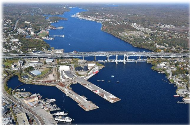
Aerial view of New London Harbor.

A region's development potential is highly correlated with its accessibility to urban-scale infrastructure. Connecticut has invested significant resources in the physical infrastructure of its cities and towns to provide for wastewater treatment capacity, potable water supplies, highways and railways, air and sea ports, telecommunications infrastructure, energy generation and transmission, and other related facilities. In order to help position the state for growth, state agencies, regional councils of governments, municipalities, private developers, and other stakeholders must coordinate their actions to leverage these assets in a manner that will take full advantage of Connecticut's strategic location within the Northeast Megaregion, while also proactively addressing the needs and desires of a changing demographic base.