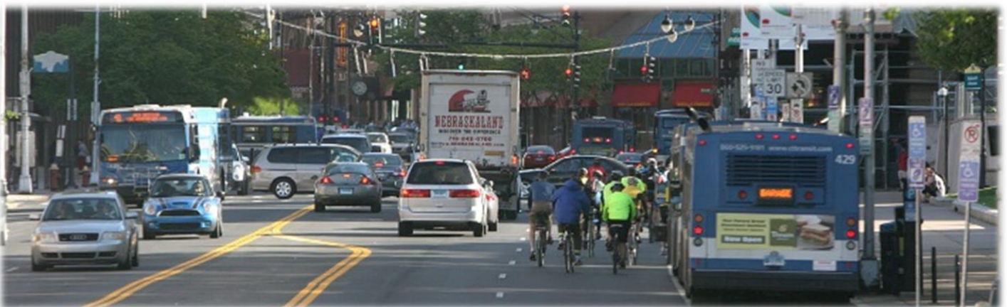
Multiple transportation modes sharing the same infrastructure.

more essential that the points in between (i.e., Connecticut's cities and towns) are integrated into the economic fabric of the greater region and its labor market. Experiences in other states have shown that transit hubs can be effective drivers of new office, commercial, and residential development. Regional coordination will be needed to maximize state investments in the transportation infrastructure through transit-supportive land use regulations around hub and station areas, effective feeder and connector services within the corridor, and access management planning to preserve the highway capacity on urban arterial roads with significant commercial development.