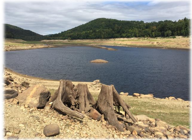
Colebrook Reservoir during drought.

Furthermore, planning for Connecticut's energy future will have particularly broad implications on our environment and society. Regulatory approaches that are environmentally sound, allow for least-cost compliance options, provide operational