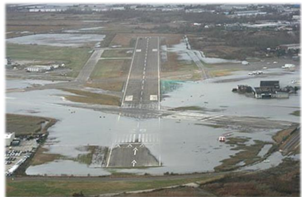
Aerial view of Sikorsky Memorial Airport.

1.13 Minimize the potential risks and impacts from natural hazards, such as flooding, high winds and wildfires, when siting infrastructure and developing property. Consider potential impacts of climate change on existing and future development.