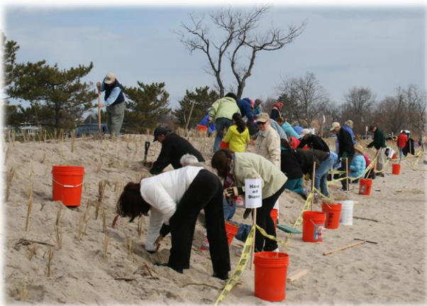
Dune restoration following Tropical Storm Sandy.

5.5 Allow redevelopment and rebuilding of coastal areas consistent with coastal area management principles and regulations and prevailing federal rules and requirements;